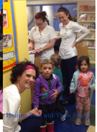
Hearing Tests with Owis School