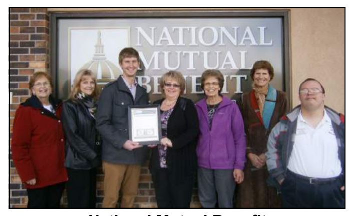
National Mutual Benefit 1410 N Ave. #6

Spearfish, SD 57783 www.nationalmutualbenefit.org 605.642.4778