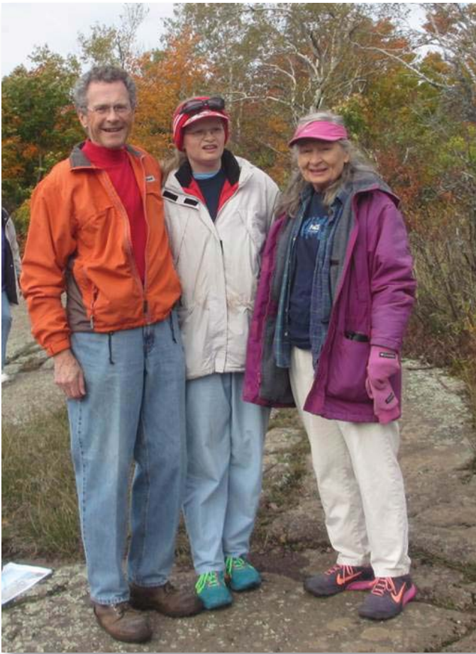
When the Wrights are not running around the country, they also enjoy hiking together. Above: The Wrights are dressed for a day of hiking in the Sawtooth Mountains of northeastern Minnesota.

Part of what makes running with cancer possible is a new treatment that comes in the form of a pill called Pomalyst. "Don is