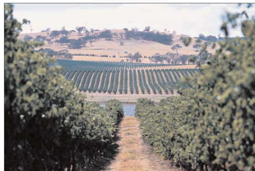
The Mildura Murray Darling is the second largest wine region in Australia. It produces more than 130,000 tons annually of Shiraz and Cabernet Sauvignon. More Chardonnay is produced in the Murray Darling region than anywhere else in Australia. Depending on seasonal variations, it contributes up to about 25 percent of the national crush.

At around $21.99, The Verdict easily earns Savannahfoodie.com's “Best Buy” designation for its elegance, accessibility and value -- it drinks far bigger than its price tag.