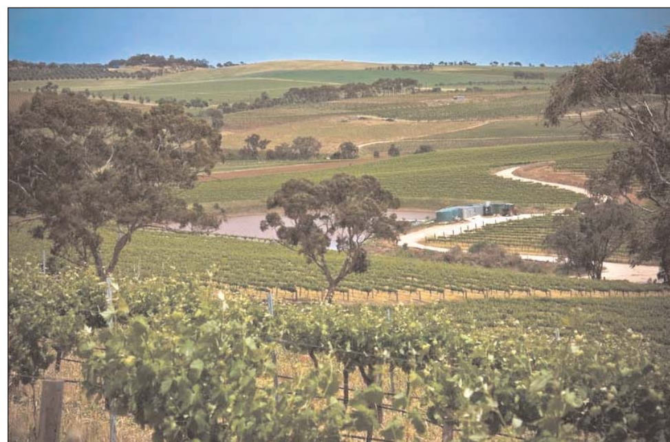
When compared to better known Australian vineyard properties and the hard scrabble soils that taunt vines to find life, the vineyards of Shinas Estate near Muldrin, Victoria, is a lush, rolling landscape.

Unlike most of Australia's mainland regions, Victoria's mountains run east to west, creating a barrier that encourages