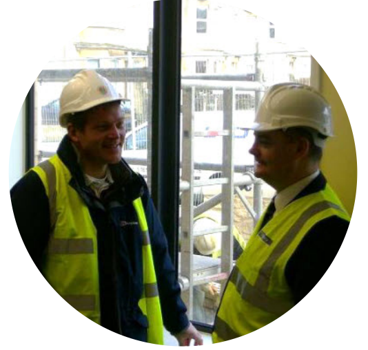
Supported the community during the building work for the new St. John's School