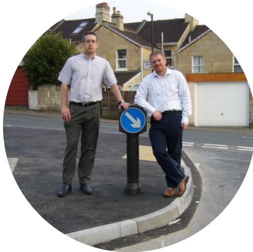
Achieved highways improvements for our area