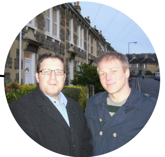
Work to improve community cohesion and tackle problems of so many shared homes