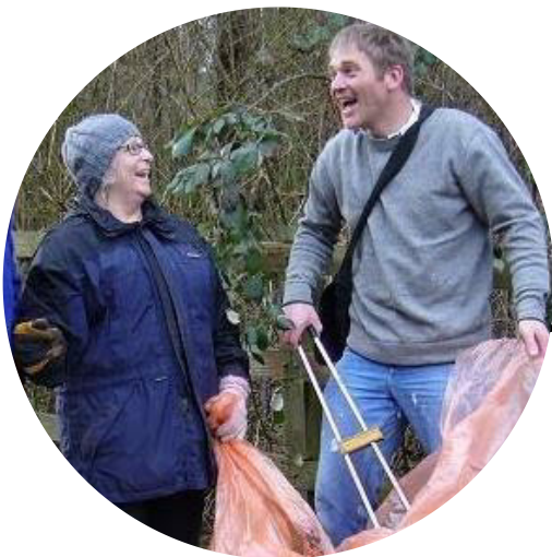
Encouraged and supported community initiatives