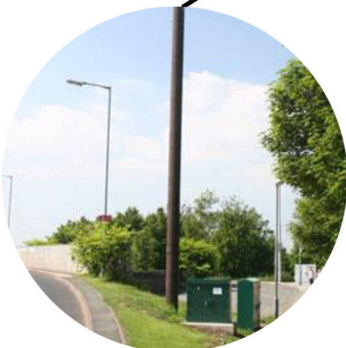
Supported residents opposing a phone mast on The Oval