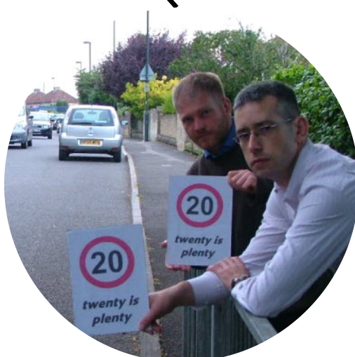
Campaigned for extended 20mph zones