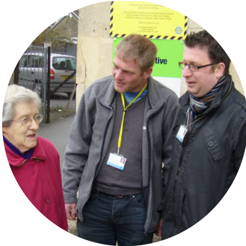
Worked with the police at PaCT meetings and held over 50 monthly public surgeries