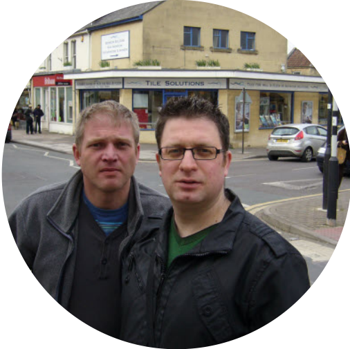
Supported Moorland Road traders to fund the Moorland Road Pig and Christmas Lights