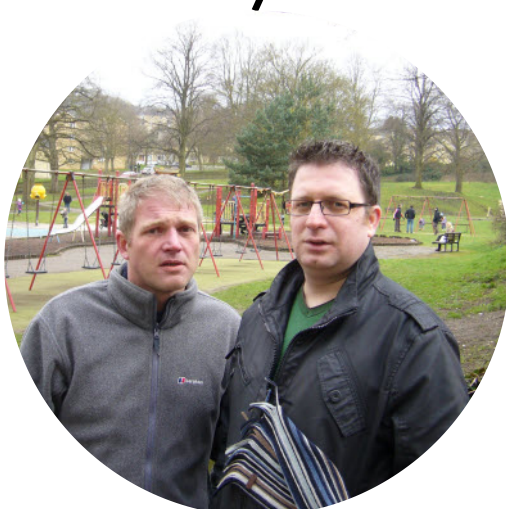
Got £40,000 of new play equipment for the Sandpits play area