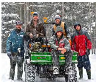
Highland Green Shovel Brigade