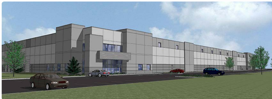
The architect's rendering above depicts the warehouse Uline will lease from Centerpoint WisPark upon completion.

In September, the Plan Commission approved Site and Operational Plans for Uline to occupy a 521,052 square foot warehouse to be constructed at 8495 116 th Street in Pleasant Prairie, Wisconsin. Uline will lease the building from developer Centerpoint WisPark. The warehouse will be used as a