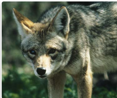
Images of adult coyotes.

During certain months of the year, Village officials begin to receive calls from residents regarding the local coyote population. Coyote sightings can increase during winter months, as the animals cover greater distances in search of food. Callers are typically seeking suggestions for handling sightings and encounters. Following is a synopsis of information provided by the Wisconsin DNR, the UW Extension and the Cook County, Illinois, Coyote Project.