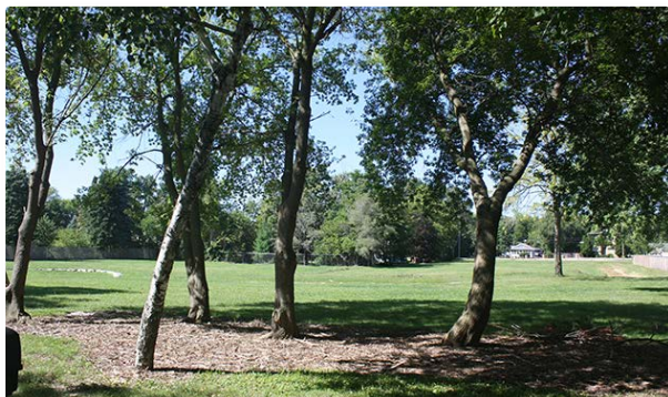
Brookside Gardens Park is located at 9115 26 th Avenue

All are invited to a brief dedication ceremony for the newest park in the Village, Brookside Gardens Park. The dedication ceremony will take place at 11:00 a.m. on Saturday, October 4. Parking for the ceremony is available along the west side of the park and along 26 th Avenue.