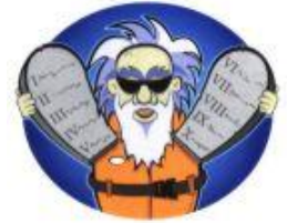
Illustration by: Rick Jimenez Powerboat Magazine