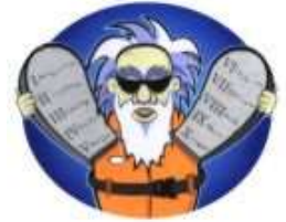
Illustration by: Rick Jimenez Powerboat Magazine