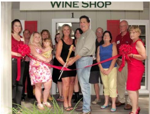
A Taste of Wine by Steve ribbon cutting 7.25.14 -- New location. 4924 First Coast Highway, Amelia Island