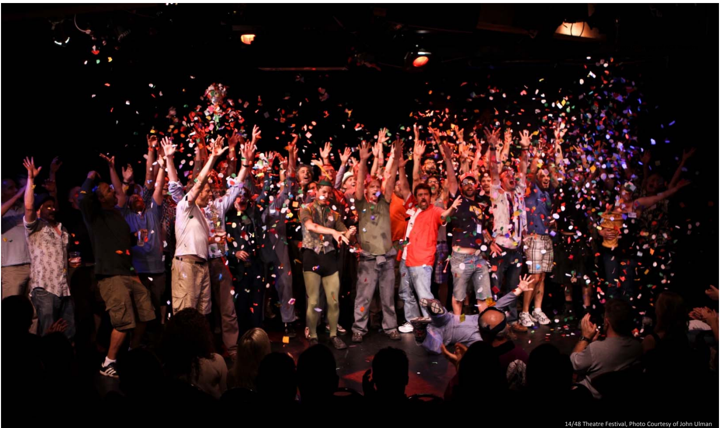
14/48 Theatre Festival