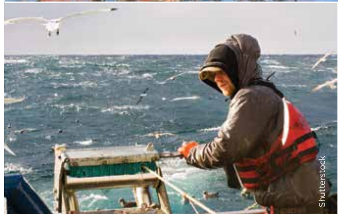
Federal fisheries management and the law that governs it have been focused almost entirely on commercial fishing.

1996 Magnuson-Stevens Fishery Conservation and Management Act (Magnuson-Stevens Act). The Magnuson-Stevens Act was again reauthorized in 2006, which added strict deadlines to end overfishing and called for annual catch limits to be put in place for all fisheries by a certain date.