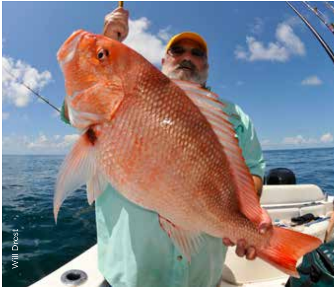
Red snapper, like this one caught in the Gulf of Mexico, are being allocated to recreational and commercial fishermen based on outdated harvest data.