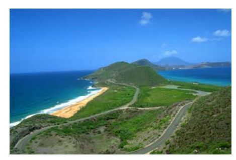
St. Kitts & Nevis: The Southeast Peninsula offers spectacular views of both the Atlantic and the Caribbean.

But the global economic downturn forced Kiawah Partners to lower its expectations for a time.